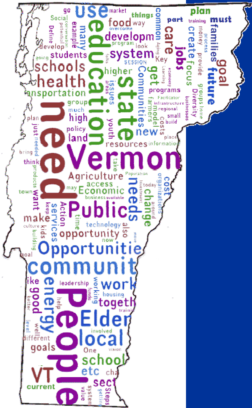
Word Map created by pasting all Summit breakout session notes into www.wordle.com